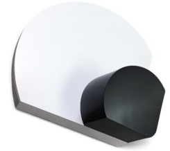
Large Spacer Block