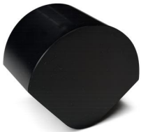
Small Spacer Block