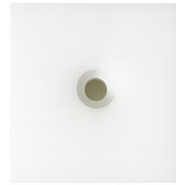
Small Cutter Block 3" x 3/4"