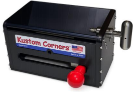
Kustom Corners Machine