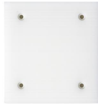
Large Cutter Block 7" x 3/4"