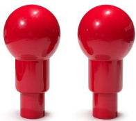
Red Ball Handles