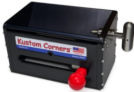
Kustom Corners Machine