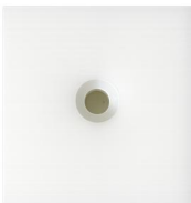
Small Cutter Block 3" x 3/4"